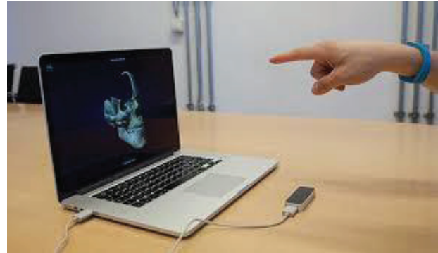
Figure 1: LEAP Motion sensor

armed the application displays a moving label (yellow = finger is not in the sensor's active range, green = finger is in the sensor's active range) indicating the position of the pointing finger within a virtual frame (width = 200 mm, height = 200 mm) located 100 mm above the sensor. The active sensor range covers \pm 100 mm before and behind the sensor, respectively.