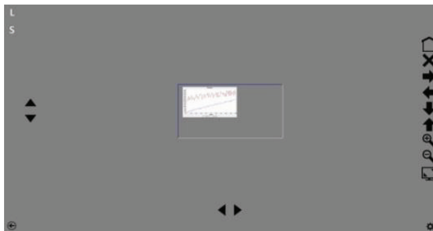
Figure 4: Web2cToGo Navigation View