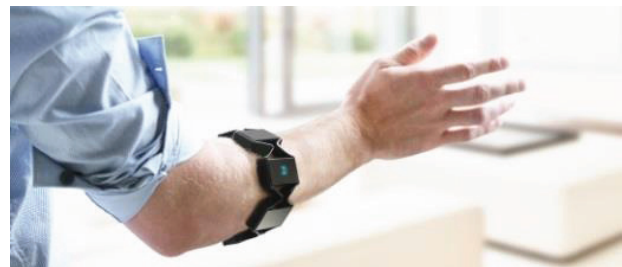
Figure 2: Myo gesture control armband

If a gesture is successfully recognized the next gesture recognition is inhibited for approximately 1s while the label is fixed to the center of the application window.