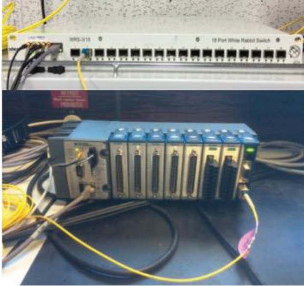
Figure 2: The test setup with the cRIO-WR module connected with the yellow fibre to the WR switch on top.

During the testing we have optimised the LabVIEW FPGA driver code for minimum delay and jitter. Figure 2 shows the cRIO-WR test setup.