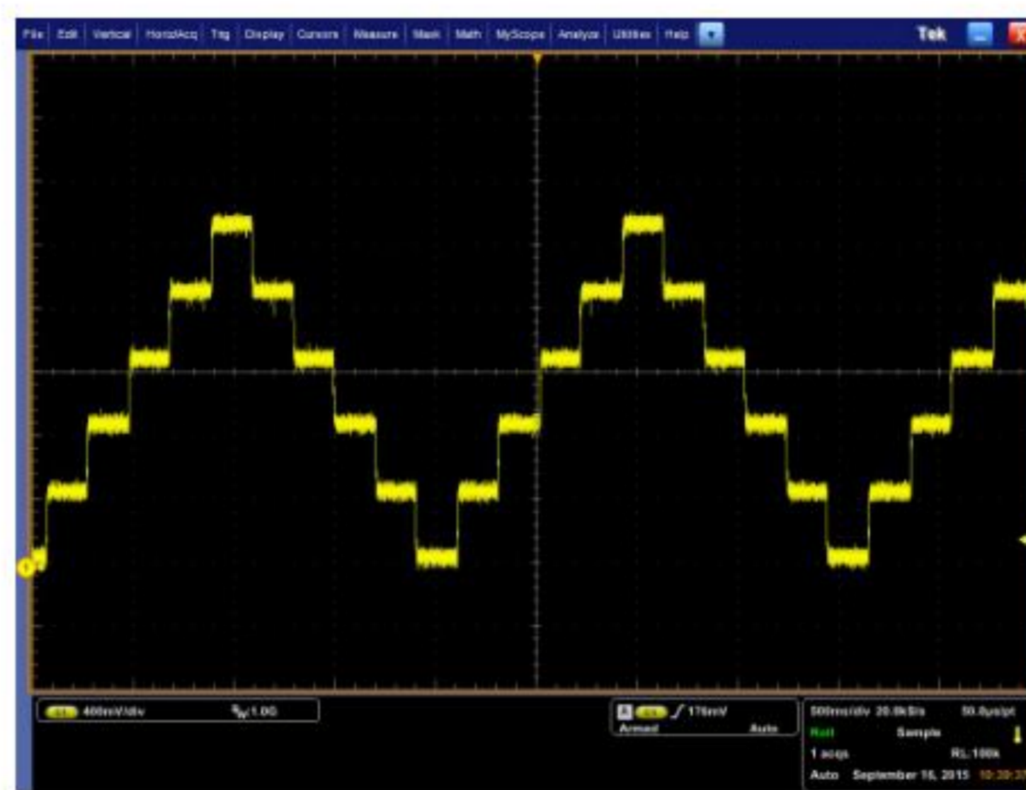
Figure 5: Switch-over of the PLC monitored by the oscilloscope